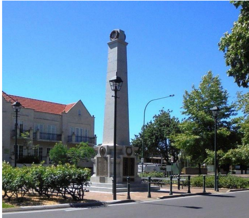
Norwood War Memorial