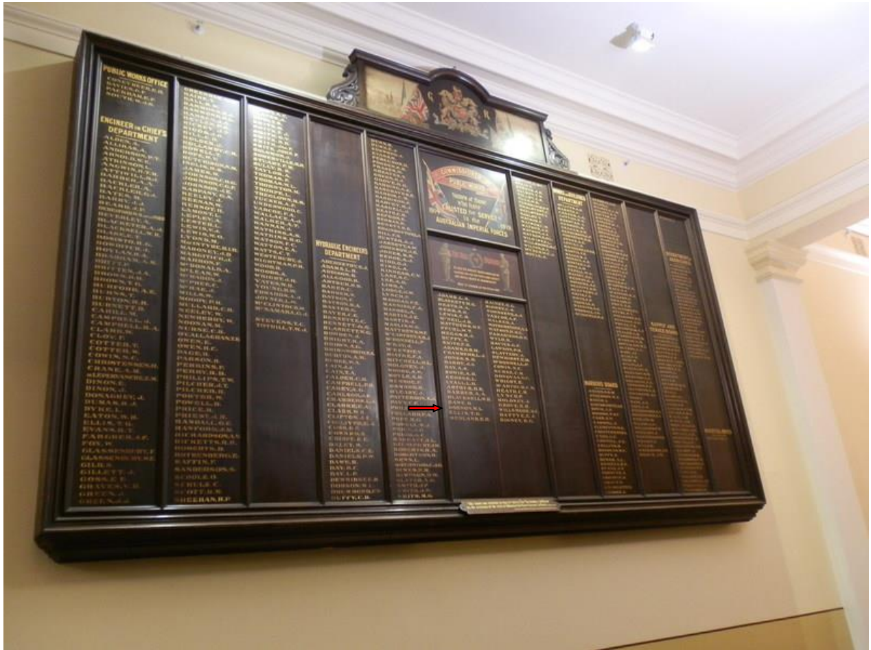
Adelaide Commissioner of Public Works Roll of Honour