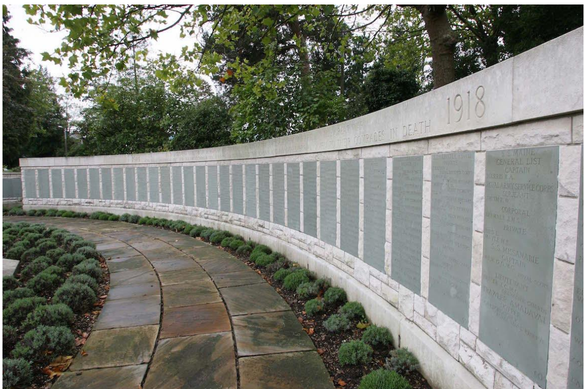
Name Panels behind Cross of Sacrifice